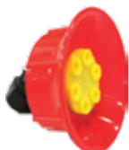
6 HOLE 6洞