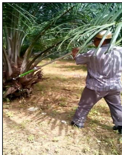
1,2,3 尺的油棕 (手握铝管向下)