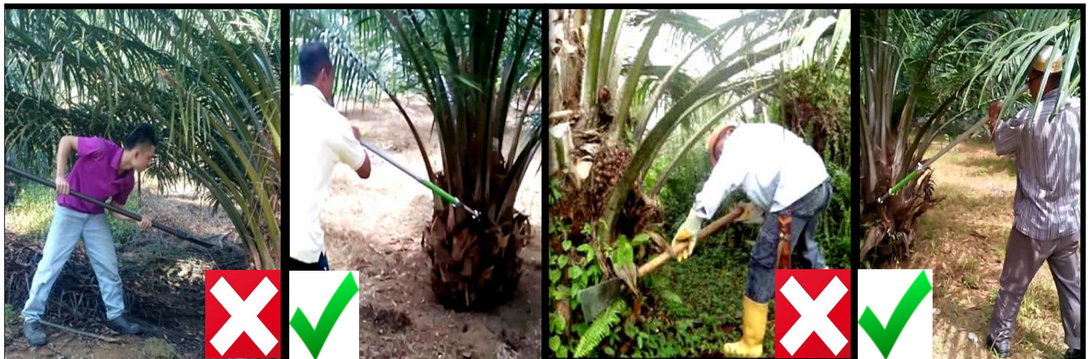
Impact Pahat DIY